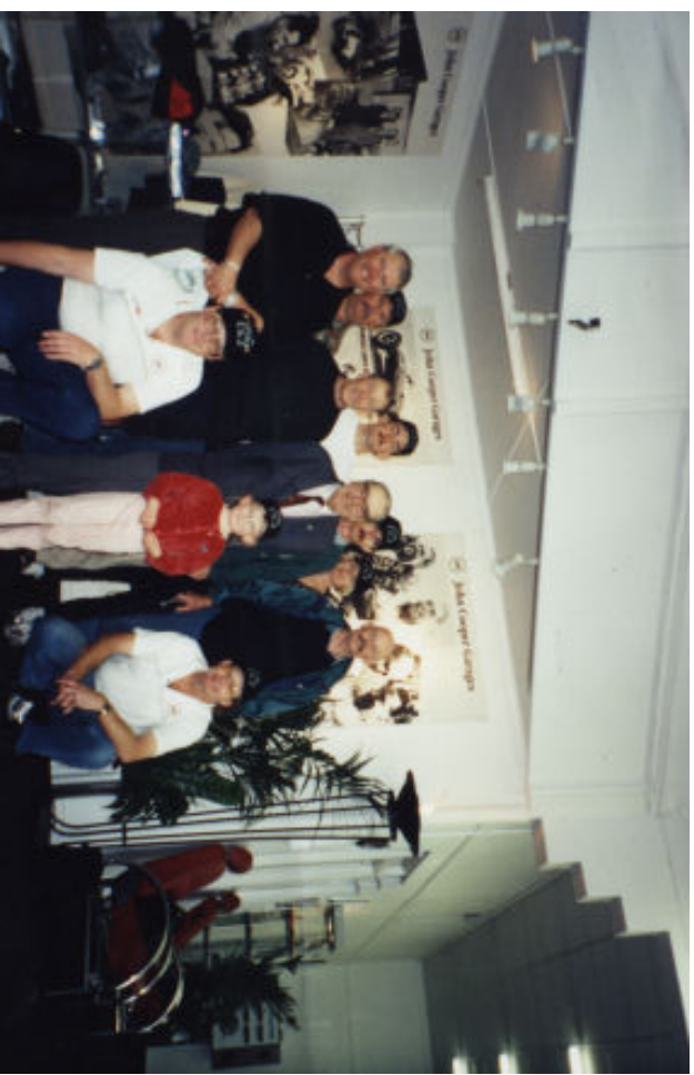
The New Zealand contingent on tour in the UK.