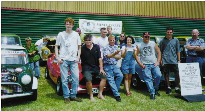
Show and shine team.

This however is only the work performed on the air; need to allow for fan efficiency to get a power input figure. At low pressures (desk fans and the like) fan efficiency can be as high as 65%; but raise