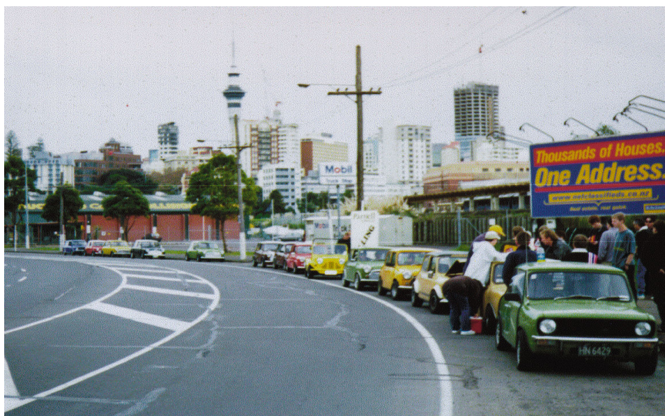
Finish of the Italian Job.