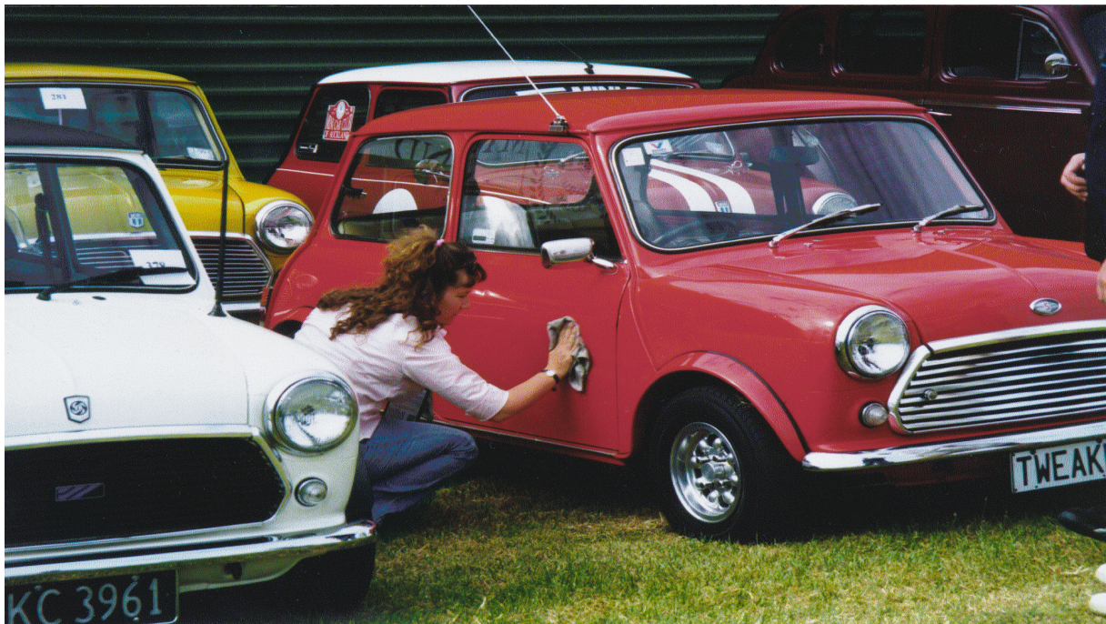
Good job, Jo-Anne

The plan is to have a fun run up to Miranda hot pools and spent de night at Miranda. The next day a tickie tour around Tames and back to Auckland.