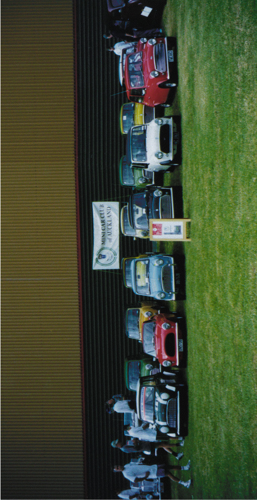
Sometimes the picture needs squeezing a bit.